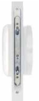
Multi-Point (Lock Upgrade)