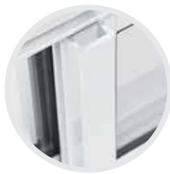
Heavy Duty Reinforcement (J)