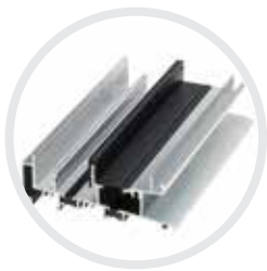
B2 Sill (Standard)