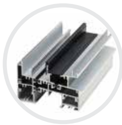
B5 Sill (Optional)