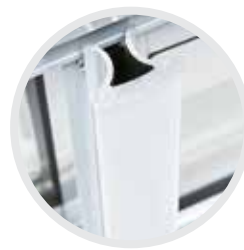
Heavy Duty Interlock